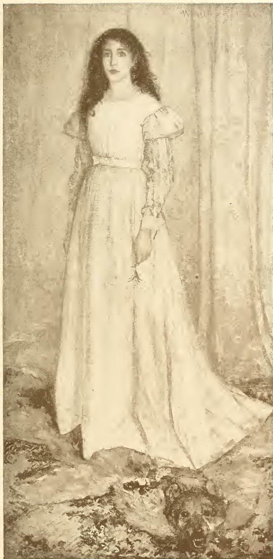
Symphony in White, No. 1.